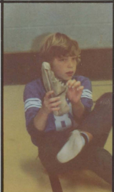
SEVENTH GRADE — pg. 50