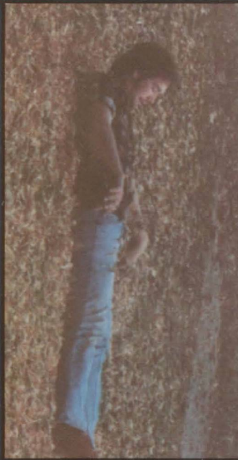
STUDENT LIFE — pg. 9