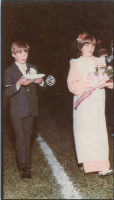
HOMECOMING — pg. 5