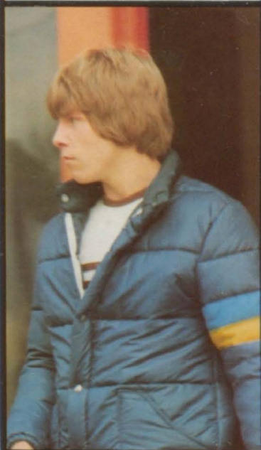
FRESHMAN — pg. 42