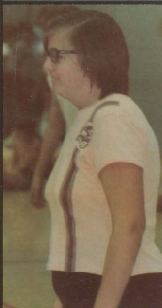
EIGHTH GRADE — pg. 46